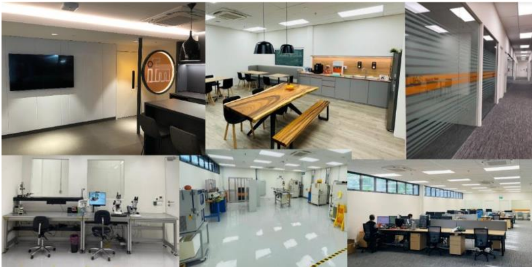
Expanded offices, R&D laboratories and discussion areas