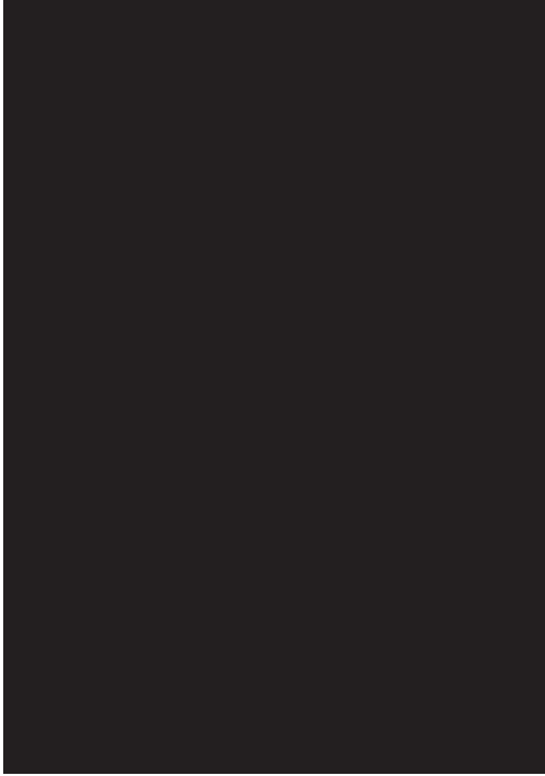
Technician at the electron microscope, Sylvania Electric Products, Bayside.

At 8:50 A.M. on July 2, two thorium explosions (the breeder material used in reactors) rocked the Sylvania Electric Products Company plant in Bayside. The Atomic Energy Commission determined there was “no radiation hazard” outside the building, and with “contamination essentially confined” to one section of the metallurgy laboratory, there was “no possibility that anyone could have taken in a measurable amount of thorium unless he was in the room when the blast occurred or entered it a few minutes after.”