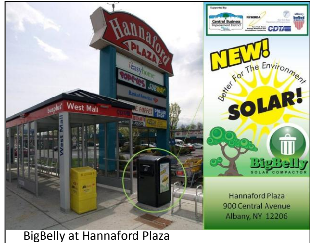
BigBelly at Hannaford Plaza

The operations of the BigBelly systems has been satisfactory. The only maintenance issue to date is that the garbage bags used in the BigBelly systems have proven significantly more expensive than conventional garbage bags. The CBID researched suppliers and found a manufacturer to custom-produce the bags. CDTA and the CBID split the cost on a large order to ensure a long-term supply. The operations of the i-Stops has been decent, with the exception of vandalism. CDTA has been pleased with the operations and maintenance of the solar shelters.