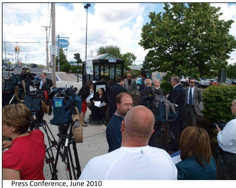
Press Conference, June 2010

Another important benefit offered by this project is the promotion of alternative sources of energy. The installation of the i-Shelters, i-Stops and BigBelly systems serve as a showcase and example of how new technologies that utilize solar energy can be used in everyday life. The use of renewable energy resources like solar power reinforces the profile of public transit as a sustainable transportation alternative, and heightens the transit agency's reputation as an innovative leader.