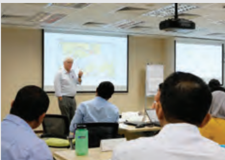
International Law of the Sea Course