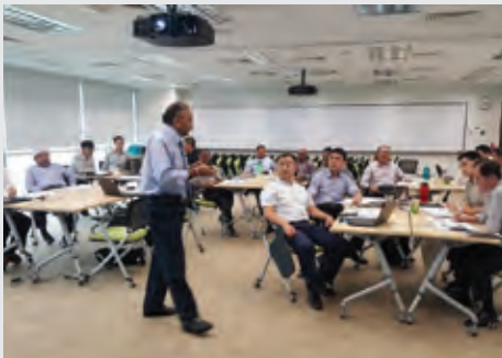
Internal Auditor International Safety Management Code/ ISO 9001 Course