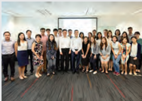
Centre for Liveable Cities 13 th Executive Development & Growth Exchange (EDGE)