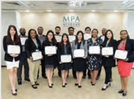
Maritime Outlook Forum