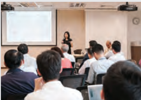
Blockchain Sharing Session