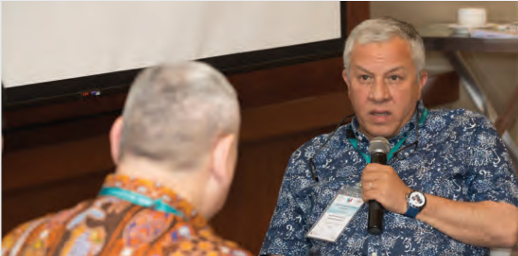
Admiral Ayman Saleh Mohamed Ibrahim Chairman Damietta Port Authority Egypt

Egypt and Singapore share a common advantage in international trade, namely their respective prime locations in East Mediterranean and in South East Asia. Both are also inspiring examples of countries which have fully capitalised on their strategic locations to serve the maritime world.