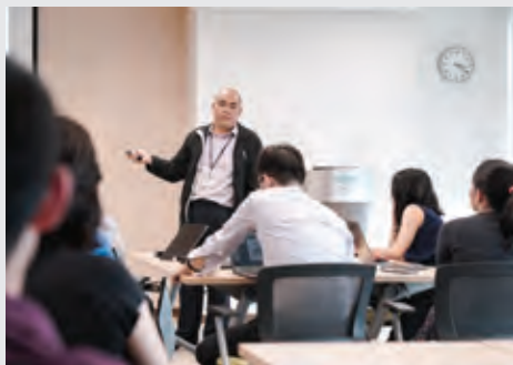
Sharing Session on Startups