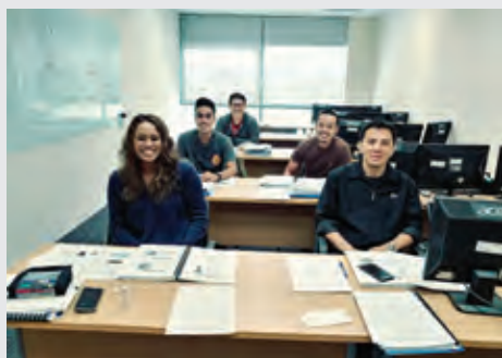
International Hydrographic Organization Cat 'B' Course