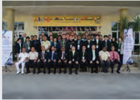
Technical Workshop on Aids to Navigation