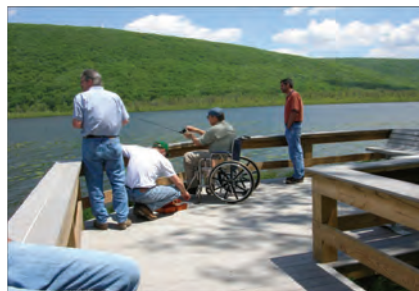
NYS DEC's Labrador Hollow accessible fishing pier in Cortland County.