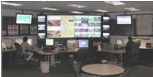
Figure 1-1: Buffalo TMC Photo