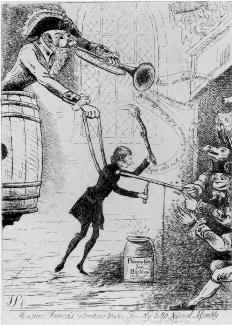
Cartoon (by Sayers, 1792) of Priestley's son William, depicted as a puppet before the French National Assembly. A contemporary note describes the cartoon (50).