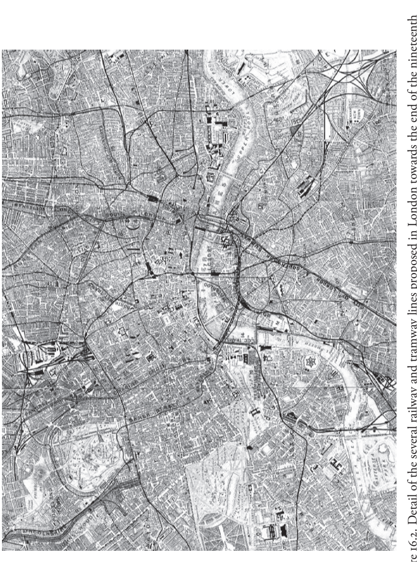
century, most of them operated by electric traction.