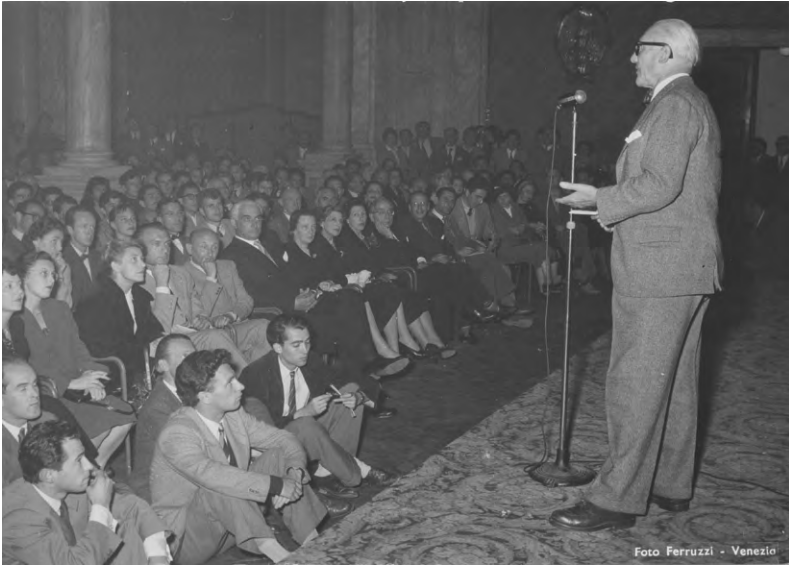
Figure 8.3 Le Corbusier at CIAM summer school in Venice (1952)