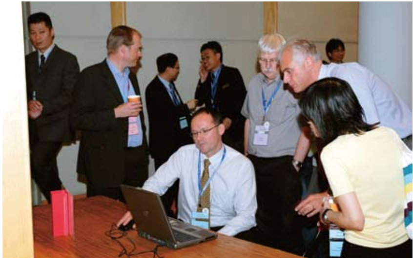
講者示範協作決策的使用。 Hand-on demonstration on CDM.

不論在運作、財政抑或環境方面，先進協作決策均能為本港航空業帶來巨大效益。有見及此，民航處在二零零八年十二月十二日的衛星通訊、導航