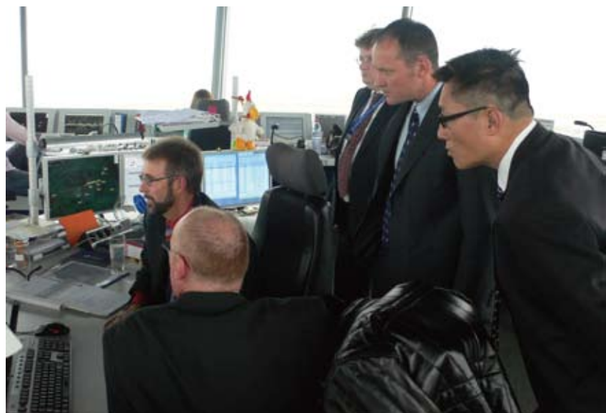
民航處代表團於2009年11月參觀慕尼黑機場的協作系統設施。 A CAD delegation visited Munich Airport for its CDM installation in November 2009.

Feedbacks from the participants were very encouraging and they all indicated their keen interests to participate in the CDM process, and supported CAD to establish a CDM Working Committee to oversee CDM implementation at the HKIA. For the way forward, CAD will continue with the CDM planning and formulate an implementation roadmap, including operational procedure and rules, in consultation with various aviation partners.