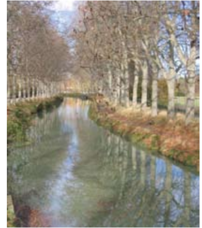
波平如鏡的南運河。 The peaceful Canal du Midi.

It was indeed a very challenging and enlightening course. Flight standards and