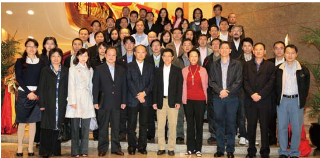
本處同事到訪中華人民共和國外交部駐香港特別行政區特派員公署時與詹永新副特派員及其他代表合照留念。 Deputy Commissioner Zhan Yongxin and other representatives of the Commissioner's Office of China's Foreign Ministry in the Hong Kong SAR pictured with CAD colleagues during their visit to the Commissioner's Office.