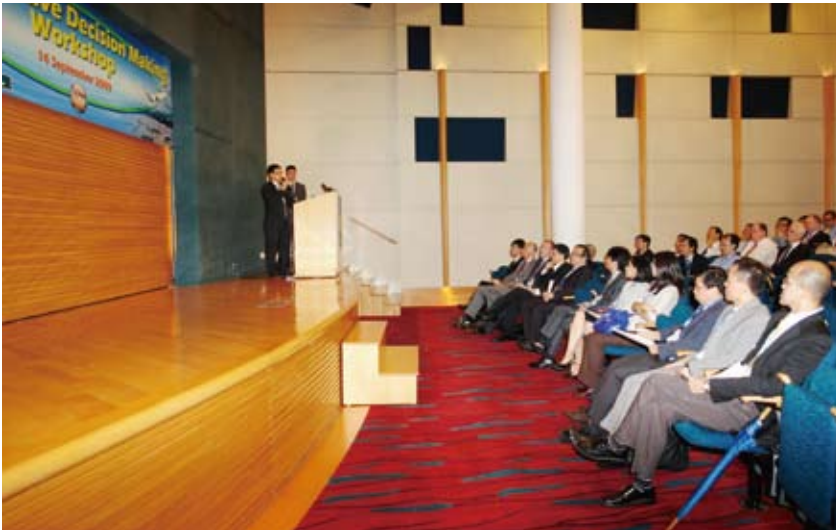
130多名代表出席協作決策工作坊。 The 1-day CDM workshop was attended by over 130 participants.

for the purposes of improving overall operational efficiency; achieving higher on-time performance; reducing flight delays and apron/taxiway congestion; optimising resources deployment; and expediting recovery of air traffic after major disruption such as adverse weather.