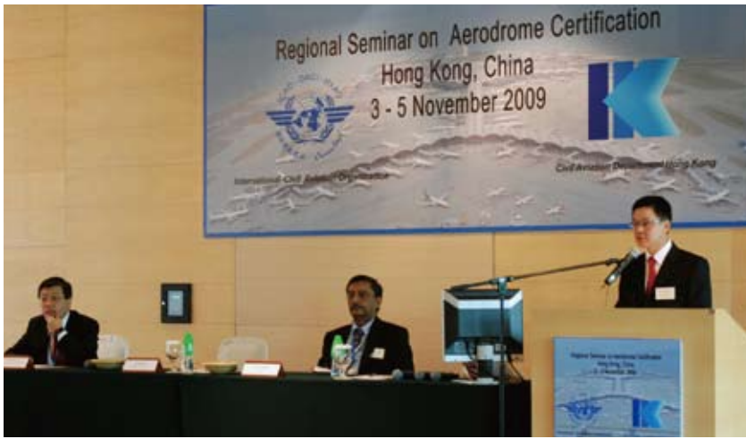
處長羅崇文在地區研討會上致開幕辭。 DG Norman Lo addresses the opening session of the regional seminar.

Aerodrome Safety Management System to CAD and Airport Authority colleagues on 2 November 2009.