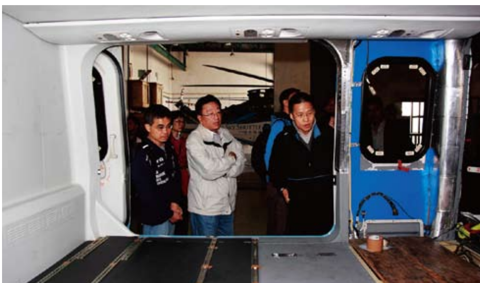
部門協商委員會到訪澳門參觀空中快線的直升機維修設施。 A tour of the helicopter maintenance facility run by Sky Shuttle during a visit by Departmental Consultative Committee to Macau.