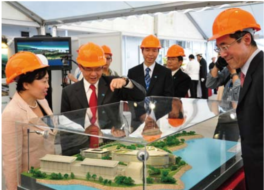
處長向政務司司長唐英年和運輸及房屋局局長鄭汝樺講解民航處新總部設施。 Director-General introduced the new CAD Headquarters facilities to Mr Henry Tang, Chief Secretary for Administration and Ms Eva Cheng, Secretary for Transport and Housing.