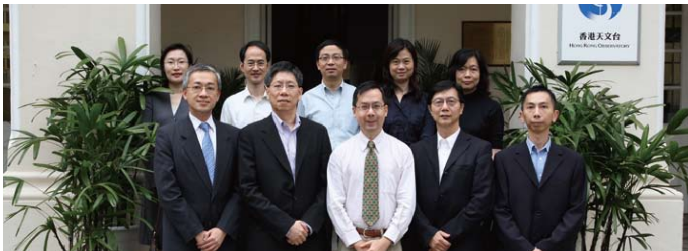
本處同事到訪香港天文台時與天文台代表合照留念。 Representatives of Hong Kong Observatory pictured with CAD colleagues during their visit to HKO's Headquarters.