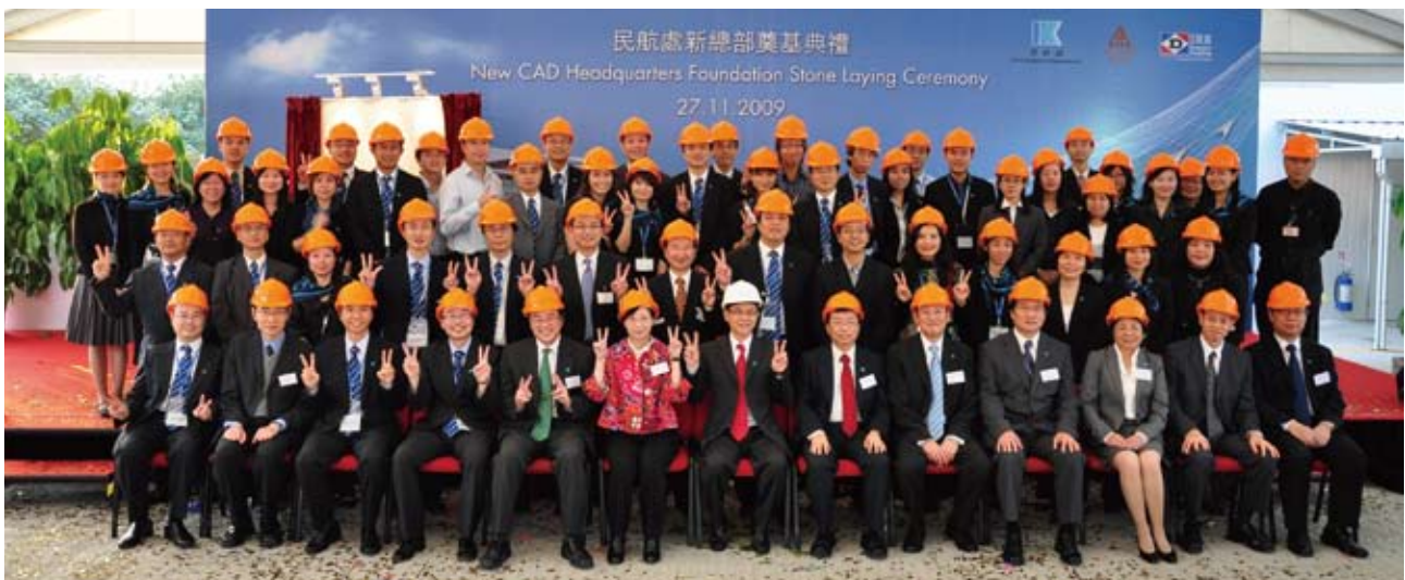
參與籌備奠基典禮及策劃民航處新總部計劃的同事大合照。 A group photo of colleagues involved in the preparation of the Ceremony and/or the planning of the new CAD Headquarters Project.