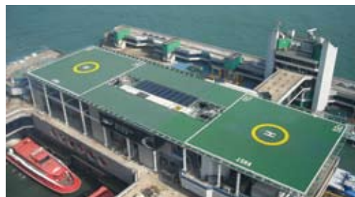
港澳碼頭上蓋直升機場擴建後全貌。 An overview of the expanded Heliport at the rooftop of MFT.

Upon the approval of the EIA Report for the project, an open tender exercise was mounted in July 2006. After fair and careful assessment, the tender for the expansion and operation of the Heliport was awarded to Sky Shuttle Helicopters Limited (formerly Heli Express Limited) and the 18-year lease for the Heliport