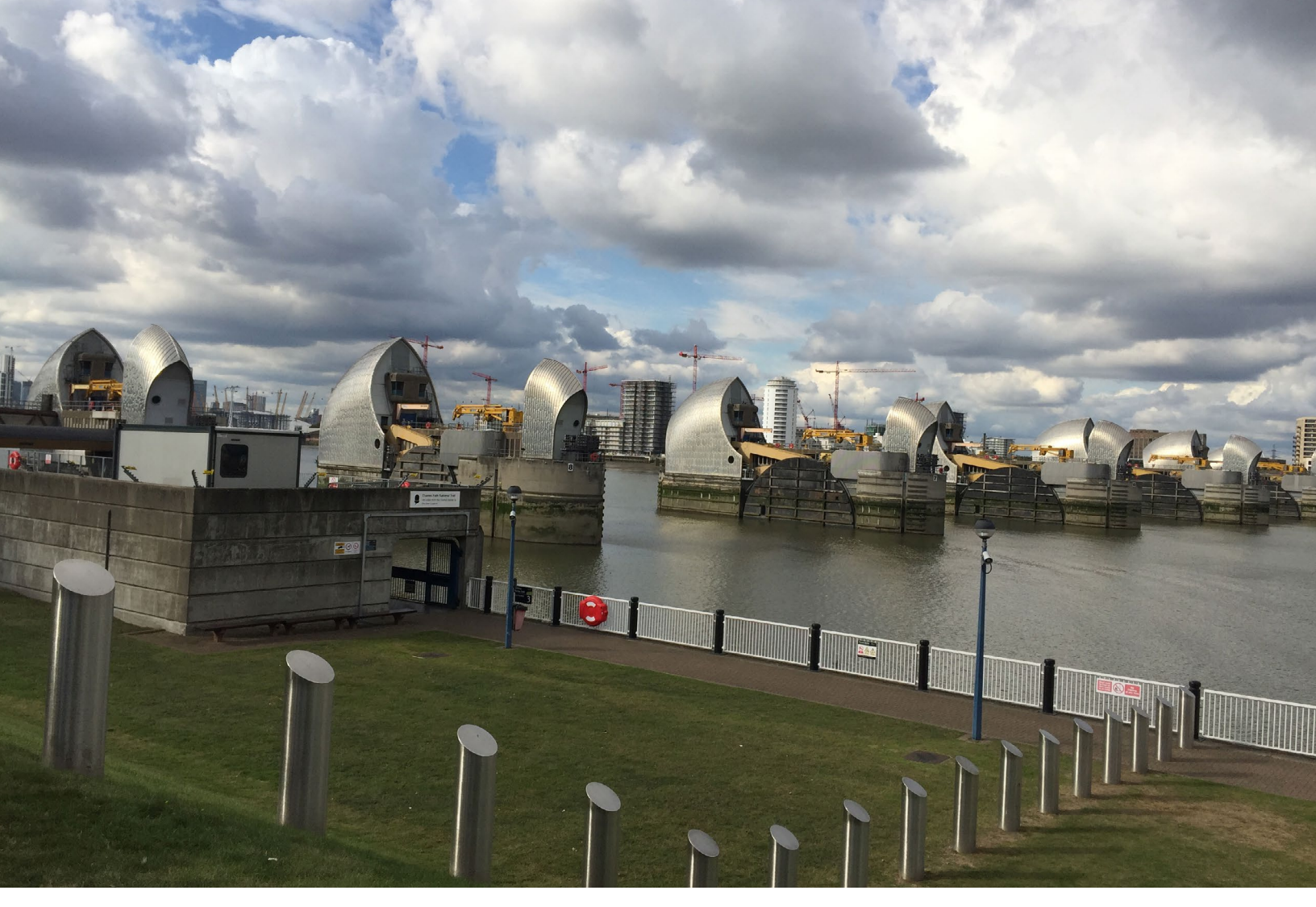
Thames barrier-London's major flood protection against storm surges and high tides.

climate adaptation plan, the London Climate Change Adaptation Strategy (LCCAS), in October 2011.<sup>11</sup> Former Mayor Boris Johnson's office solicited ideas from the public for inclusion in the strategy, including through a digital media campaign asking residents how they are adapting to a changing climate. The LCCAS is based on 2009 climate change projections from the UK's official center for climate change research, the Met Office Hadley Centre.<sup>12</sup> Its scope includes identifying climate risks, assessing how best to manage these risks, and implementing actions to address the risks; it encourages leaders to take on adaptation activities despite the uncertainties and contemplate how to manage the residual risk. The LCCAS also outlines thirty-four initiatives to make the city more resilient.