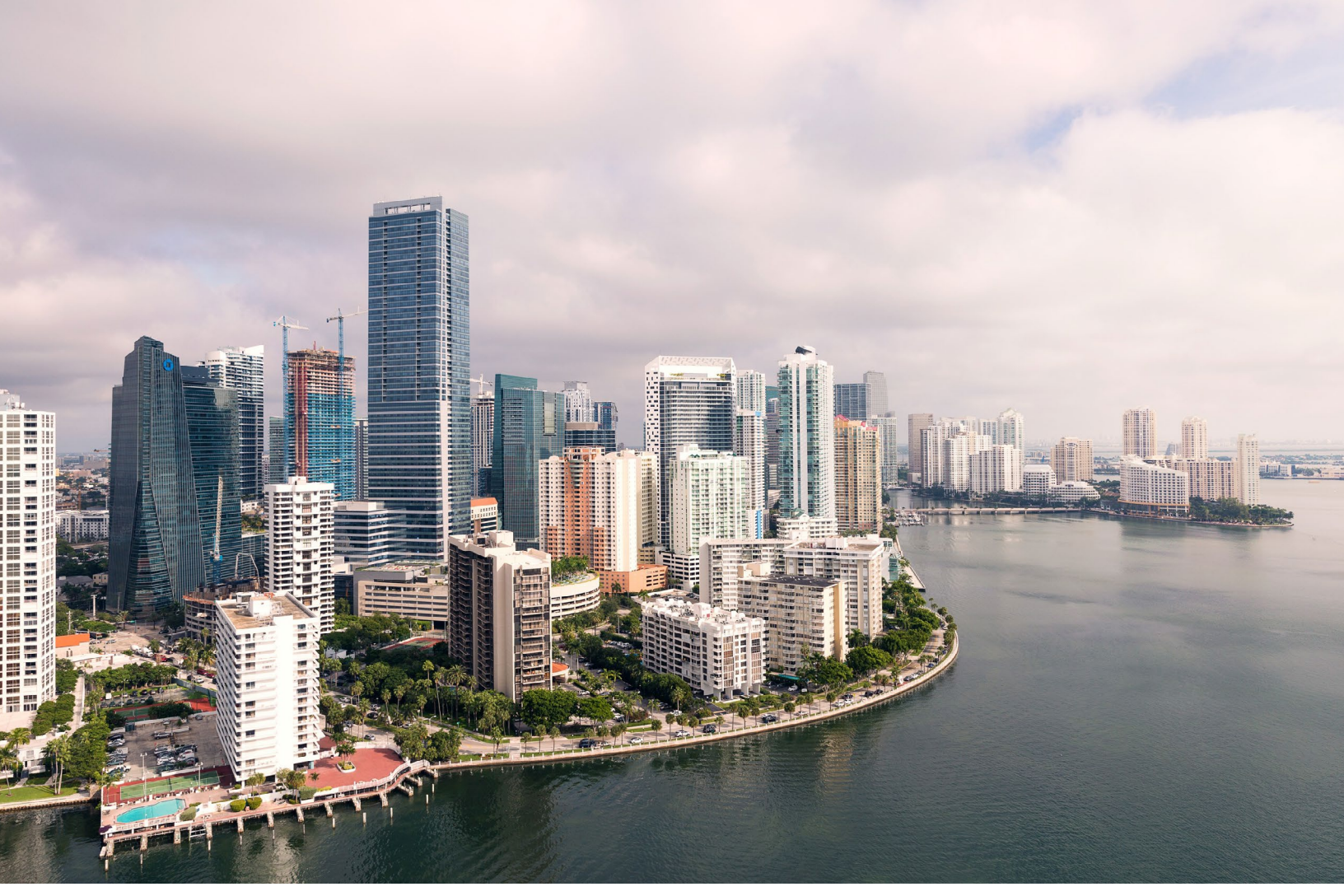
Miami cityscape.

adaptation investments. Private developers are taking a leadership role in making buildings more resilient, but the success of their investments also relies on other public infrastructure systems being adaptive and able to serve residents and businesses. Additionally, those private developers building with adaptation in mind tend to be high-end developers, reinforcing the line that divides those with and without adaptive capacity, with the potential to exacerbate socioeconomic inequalities.