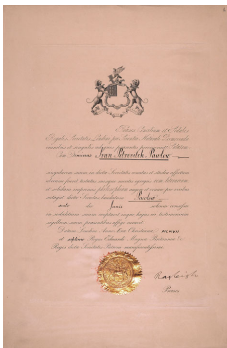
Figure 3. Certificate of the election of Ivan Pavlov as a foreign member of the Royal Society, 1907.