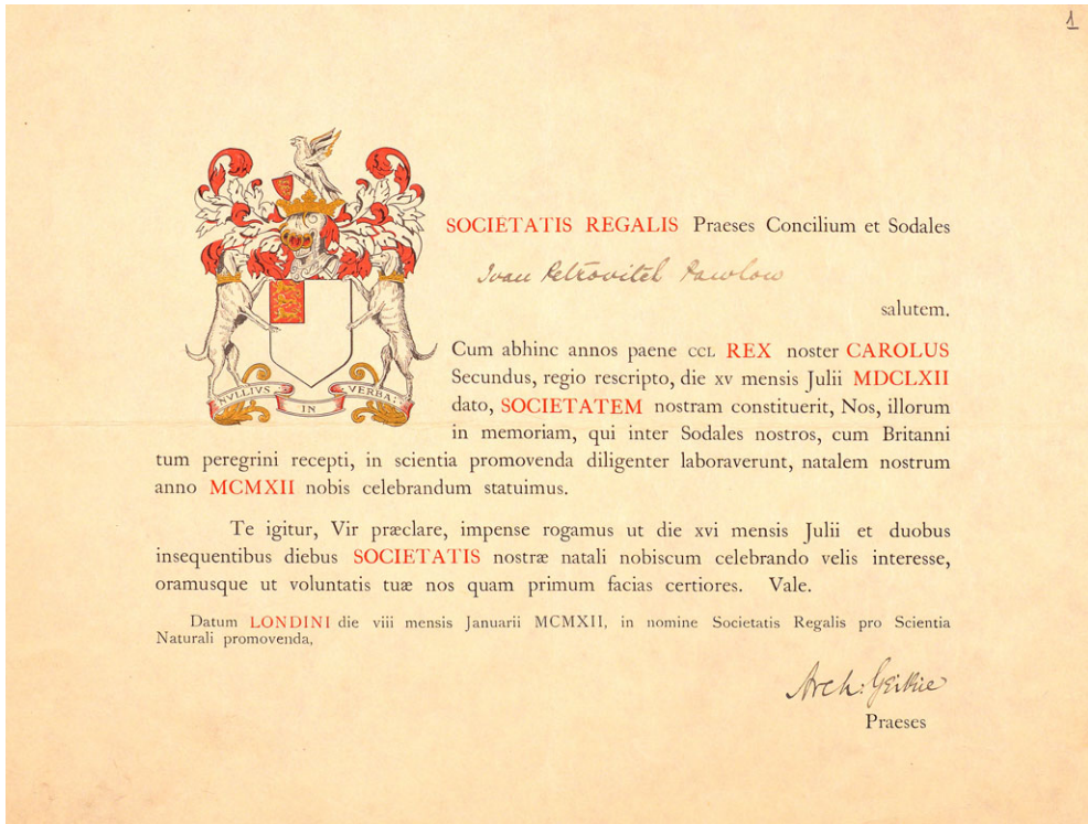
Figure 4. Letter of invitation of Ivan Pavlov to celebrate the 250th anniversary of the Royal Society of London, 1912. (From the St Petersburg Branch of the Archive of the Russian Academy of Sciences.)

the war, he visited England on a number of occasions: Barcroft pointed out that Pavlov had attended the Neurological Congress in London in 1935; and in 1928, he gave the Croonian Lecture at the Royal Society. This lecture, named after William Croone (1633–1684), is a prestigious lecture in the biological sciences delivered annually at the invitation of the Royal Society. When describing Pavlov's character, Barcroft emphasized that 'no better example than Pavlov could be quoted to illustrate the kinship between simplicity and greatness'. 57