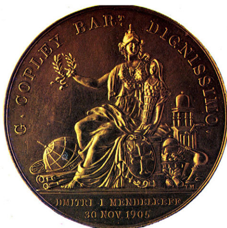
Figure 1. Copley Medal (1905) awarded to Dmitri Mendeleev.

Another Russian scholar, the talented chemist Dmitrii Mendeleev (Mendeleeff) (1834–1907), who formulated the Periodic Law and created the periodic table of chemical elements, was well known in Great Britain. 27 In 1872, during the International Exhibition in London, Mendeleev was given a medal for important discoveries and inventions. 28 Ten years later, the Royal Society awarded him the Davy Medal (jointly with Lothar Meyer (1830–1895)), the highest honour for a chemist. 29 Mendeleev gave many lectures and talks at British universities on the occasion of his being granted honorary doctorates. He delivered talks in Edinburgh (1884), Cambridge (1894) and Oxford (1894). In 1888 he became an honorary member of the Royal Society of Edinburgh, and a year later an honorary member of the Royal Irish Academy (1889). In addition, he was a member of the Royal Institution of Great Britain (1891) and other British societies. In 1892 he became a foreign member of the Royal Society. 30