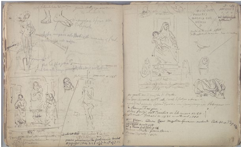
Fig.3.1 G. B. Cavalcaselle (1819–97), from S. Botticelli, Saint Sebastian (Berlin, Gemäldegalerie), Venice, Biblioteca Nazionale Marciana, cod.It. IV 2037 (= 12278), notebook 15, c.80v.

trunk. Later he added some remarks about the feet ( ‘si angolare disegno alla Pollajuolo’ ) and a first reference to Botticelli regarding the ‘testa un poco alla Botticelli’ , a name which is a moment later denied: ‘ma non è Botticelli – svelto, bello nella mossa’ . Cavalcaselle then hazards a guess: ‘sia Castagno?’ Finally, possibly after having studied some paintings in the Accademia in Florence, either Primavera or the Coronation of the Virgin , 21 but in any case following his return to Italy in 1857, he writes down decidedly the name of Botticelli.