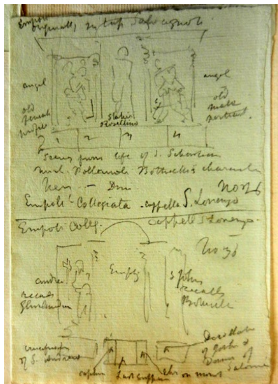
Fig.3.4 J. A. Crowe (1825–96), from F. Botticini, Tabernacle of St Sebastian (Empoli, Museo della Collegiata), London, National Art Library, 86.ZZ.33, box 1.

Bode's article, 61 and he was perhaps too inclined towards Vasari (and – through Crowe – too intimidated by Pater's success) to exclude the painting from Botticelli's oeuvre; but it is also possible that he and Crowe were moving towards a different solution.