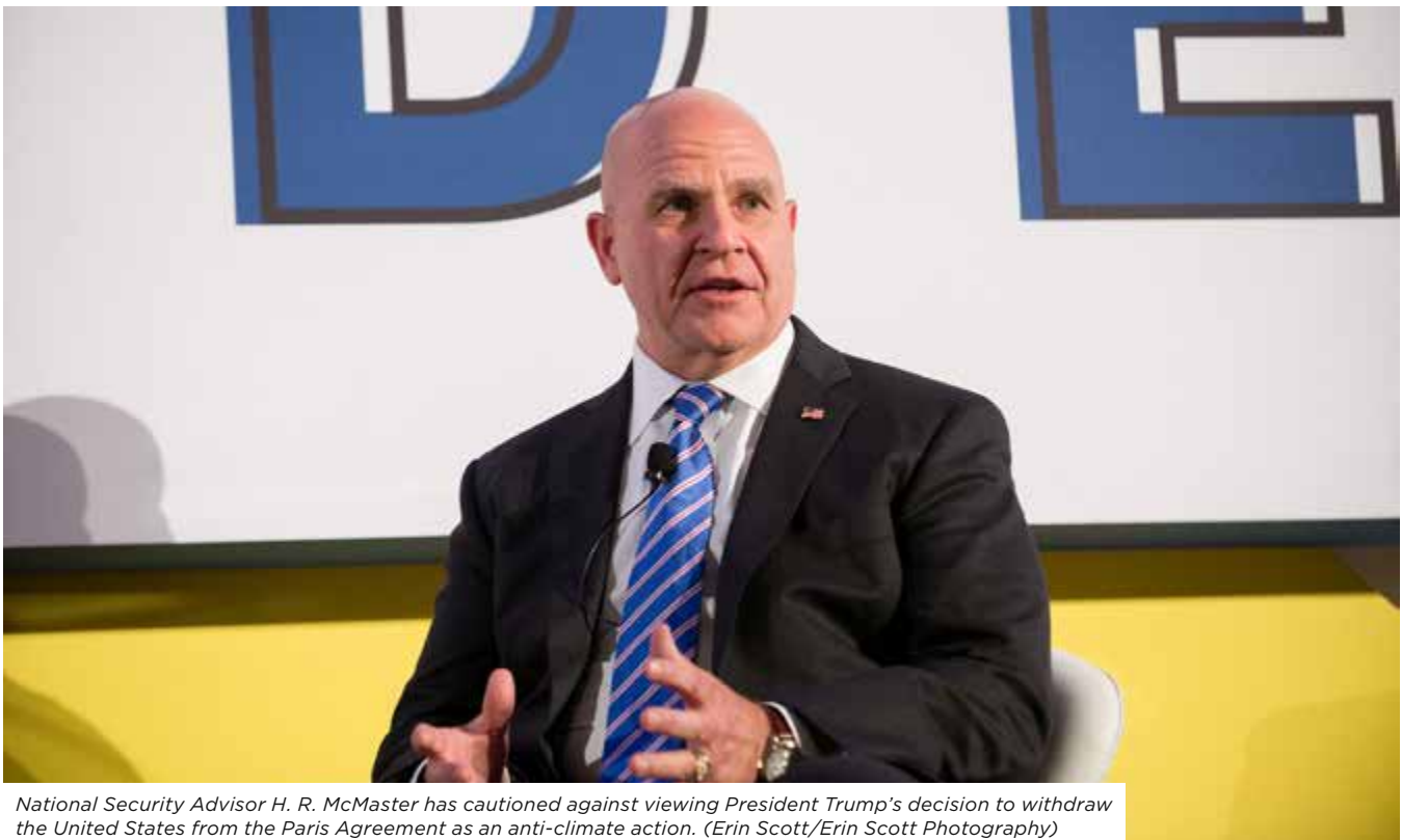
National Security Advisor H. R. McMaster has cautioned against viewing President Trump's decision to withdraw the United States from the Paris Agreement as an anti-climate action.

The first sections of this report focus on analyzing in some detail each of the four themes outlined above. Based on this analysis, the final section of the report offers a series of strategy and policy recommendations for carrying forward a climate-friendly clean energy agenda.