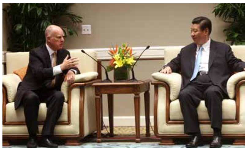
State and local decisionmakers like California Governor Jerry Brown, pictured above meeting Chinese President Xi Jinping, are taking strong action on climate, including coordination with major emitting nations.

But the fact remains that taking action on climate change is supported by a substantial majority of the