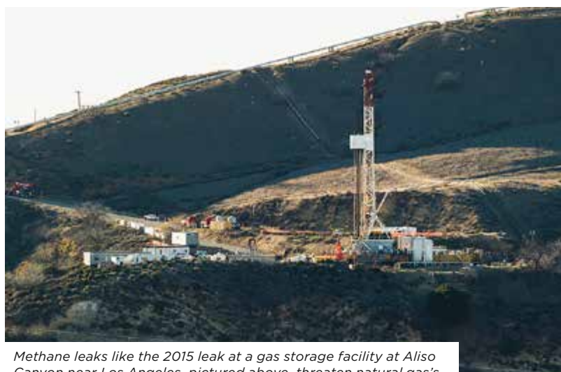
Methane leaks like the 2015 leak at a gas storage facility at Aliso Canyon near Los Angeles, pictured above, threaten natural gas's credibility as a clean alternative to coal.

Though methane lives in the atmosphere for a much shorter period than carbon dioxide, it has a much higher greenhouse gas potency, assigning it a significantly higher global warming score. As a result, the growth in methane emissions from oil and gas production in the United States has been a focus of environmental groups. The Obama administration took federal actions to impose methane limits on oil and gas wells and related infrastructure, raising concerns among producers about onerous costs. The current administration is keen to roll those policies back, but there is still an opportunity for the United States to take advantage of the notable progress to detect and capture methane already achieved by U.S. industry. In particular, the EPA's Natural Gas STAR program has helped encourage the development and deployment of methane reduction technologies.