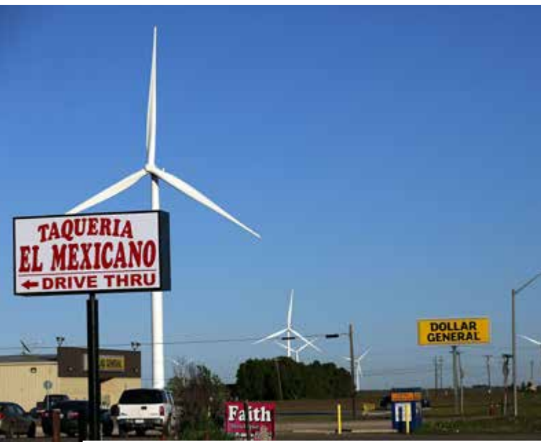
Support for renewable energy in Republican states has been strong. Pictured above is a wind farm in Texas, the largest producer of wind energy in the United States.

But Republican support for clean energy has been more resilient. In Republican-leaning states, such as Texas, state support for renewable energy has been strong, but it is not motivated by a mandate to address