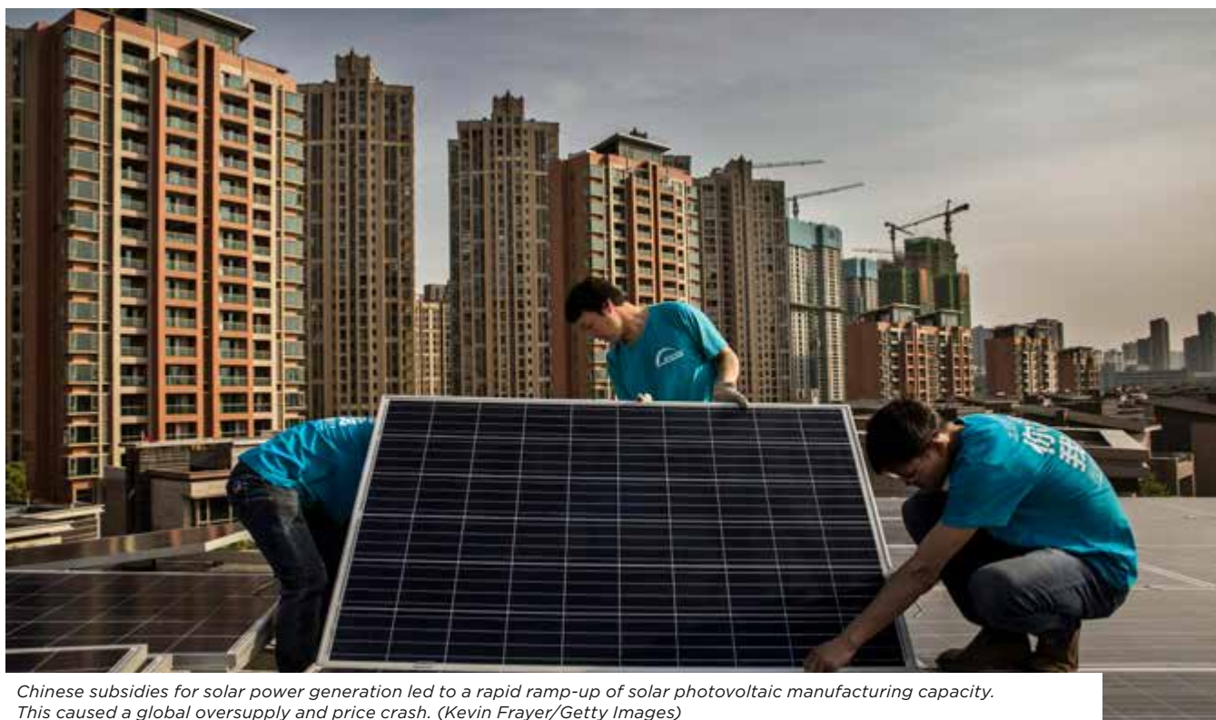
Chinese subsidies for solar power generation led to a rapid ramp-up of solar photovoltaic manufacturing capacity. This caused a global oversupply and price crash.

from Paris. 23 Europe knows that it cannot go at it alone on climate change, and that, as the world's largest emitter, China would make a good partner. In recent years, China has made a major – and successful – effort to become the global leader in several renewable energy sectors. In fact, Beijing's generous subsidies for solar power generation – and the over $100 billion that it channeled into renewables in 2015 alone – led to a rapid ramp-up of Chinese solar photovoltaic manufacturing capacity, which in turn led to a global oversupply and price crash that lifted the viability of solar power in markets across the world. 24 And now China is stepping up its foreign investments in renewables, just as many countries are eager to boost their own investments in that space.