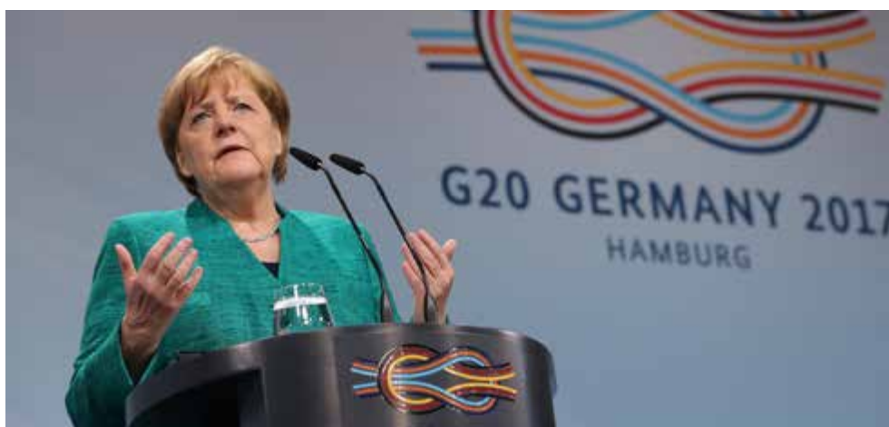
During her closing remarks at the G20 Summit in Hamburg in July 2017, German Chancellor Angela Merkel criticized the U.S. decision to withdraw from the Paris Agreement and affirmed a commitment to the agreement from the group’s other 19 members.

What are the risks that U.S. businesses might face? To start, U.S. companies fear that they will be locked out of export opportunities if other countries decide to impose a border-adjusted carbon tax on manufactured goods from countries outside of the Paris Agreement (i.e., the