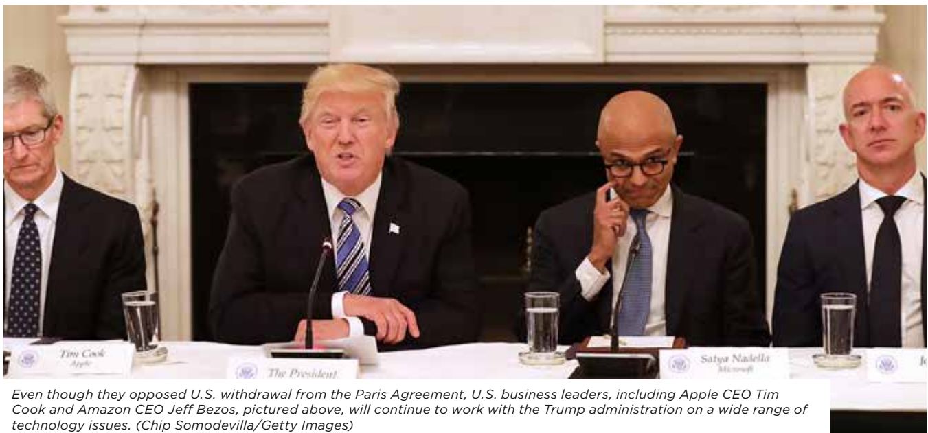
Even though they opposed U.S. withdrawal from the Paris Agreement, U.S. business leaders, including Apple CEO Tim Cook and Amazon CEO Jeff Bezos, pictured above, will continue to work with the Trump administration on a wide range of technology issues.

There is little doubt that China sees the U.S. withdrawal from the Paris Agreement in the same way that it looked at the Trump administration's decision to not move forward on the Trans-Pacific Partnership (TPP) – as an opportunity to portray itself as a global good citizen and to demonstrate support for addressing a widely shared global economic and security challenge. 22 In particular, European states, whose publics give far greater salience to climate issues than publics in any of the other major countries in the world, are looking to China to take up the mantle of leadership in the face of the U.S. withdrawal